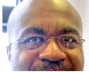
Accused Hopkins gynecologist suffocated himself with helium